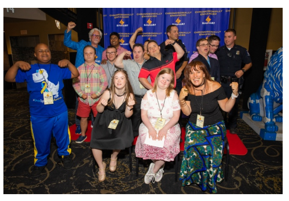
The Movie Team